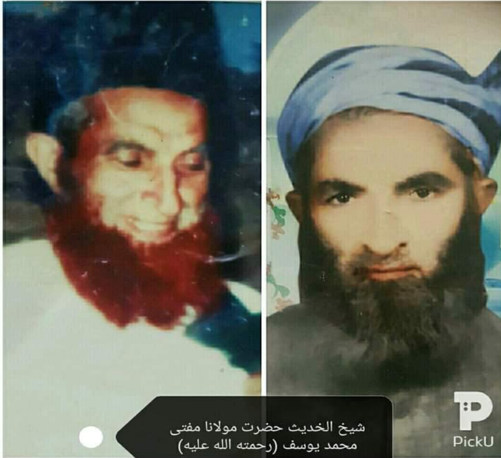
Fig 1.1 Mufti Muhammad Yousaf Sahib (Late)